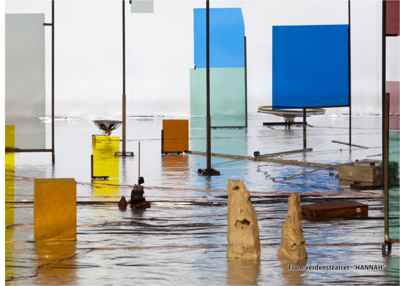
From verdensteatret - 'HANNAH'