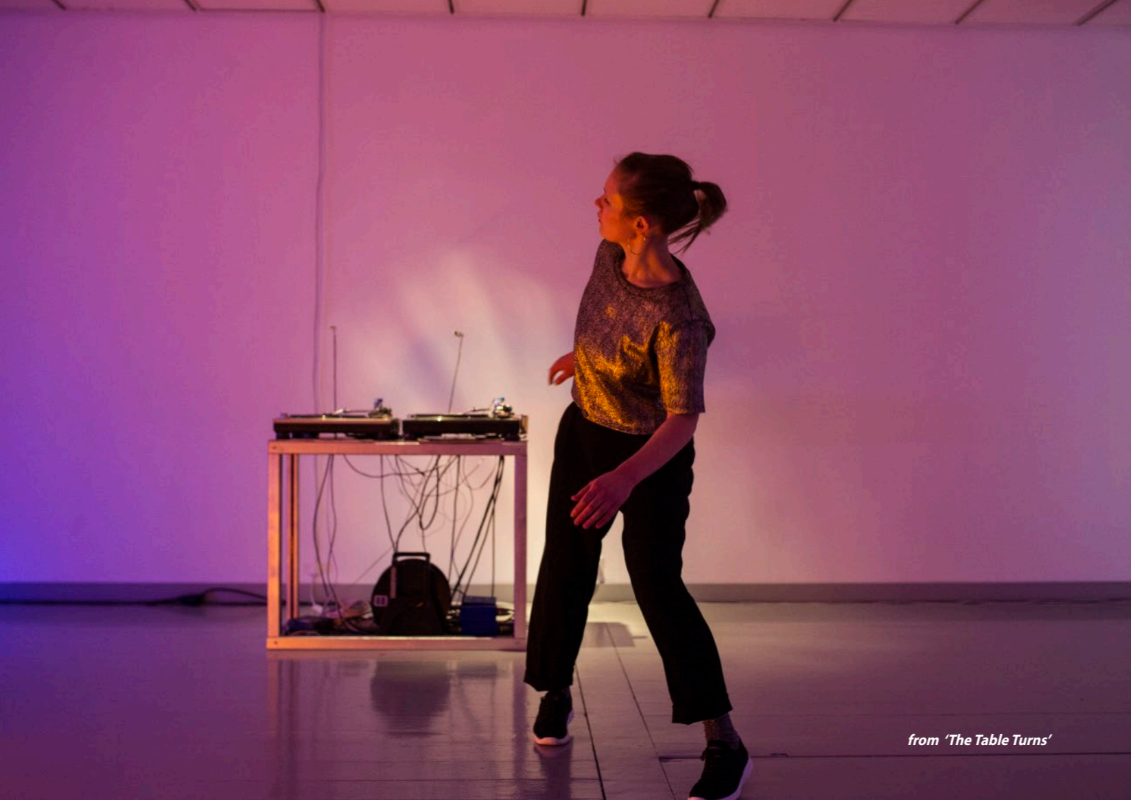
from 'The Table Turns'